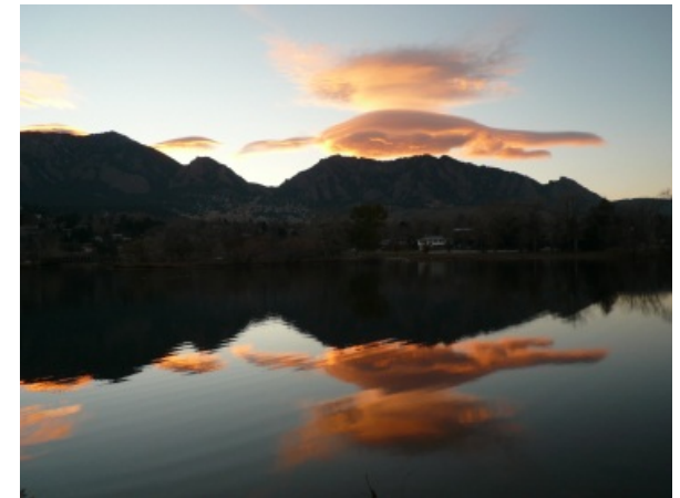
Lenticularis clouds. Rocky Mountains, Boulder, Co, November 12, 2012

Papers on similar topics can be included in the school. Number of papers presented by one author is not limited.