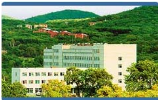
POI FEB RAS

The Institution of the Russian Academy of Sciences V.I.II'ichev Pacific Oceanological Institute FEB RAS